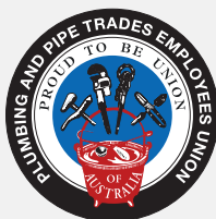
Plumbing and Pipe Trades Employees Union Queensland

While many traditional training providers struggled to keep pace, PICAC has evolved to meet the demands of the workforce, training over 5000 individual students in over 500 individual courses. PICAC has become a definitive point of reference. A place where the role of Plumbing as the key enabler of economic growth and environmental sustainability is recognised, developed and promoted.